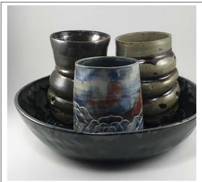
"Tumblers in a Bowl" (3 rd Year Student - 2019)