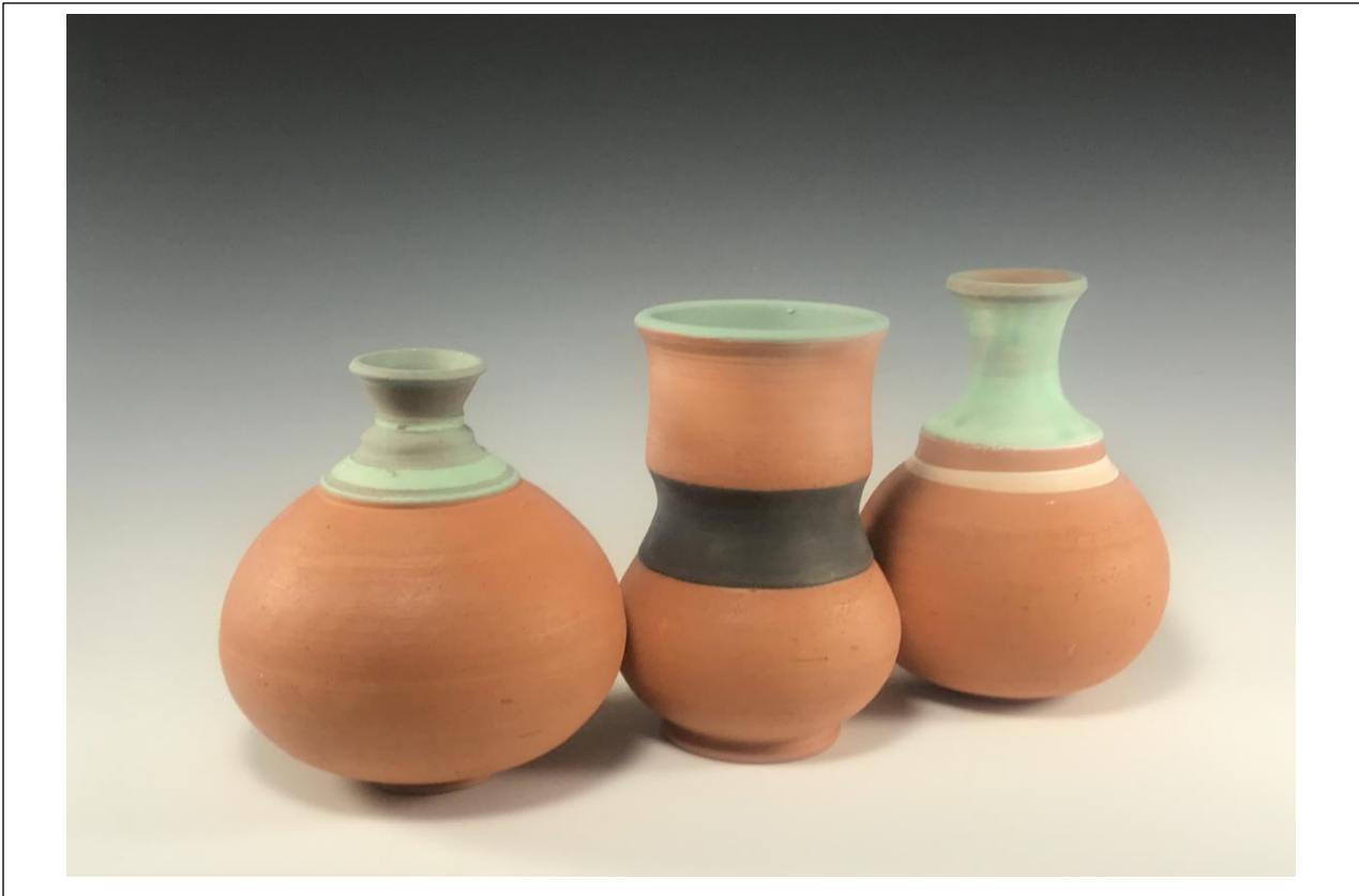
"Flower Set" (4 th Year Student - 2020)