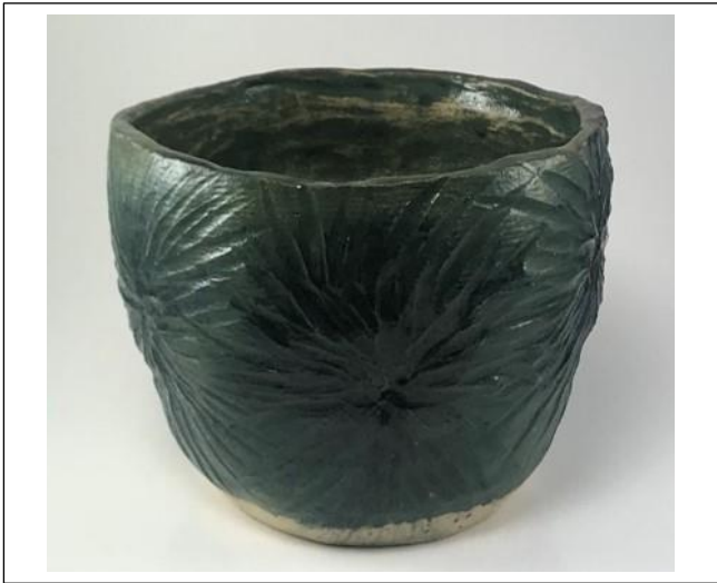
"Carved Cup" (1 st Year Student - 2019)