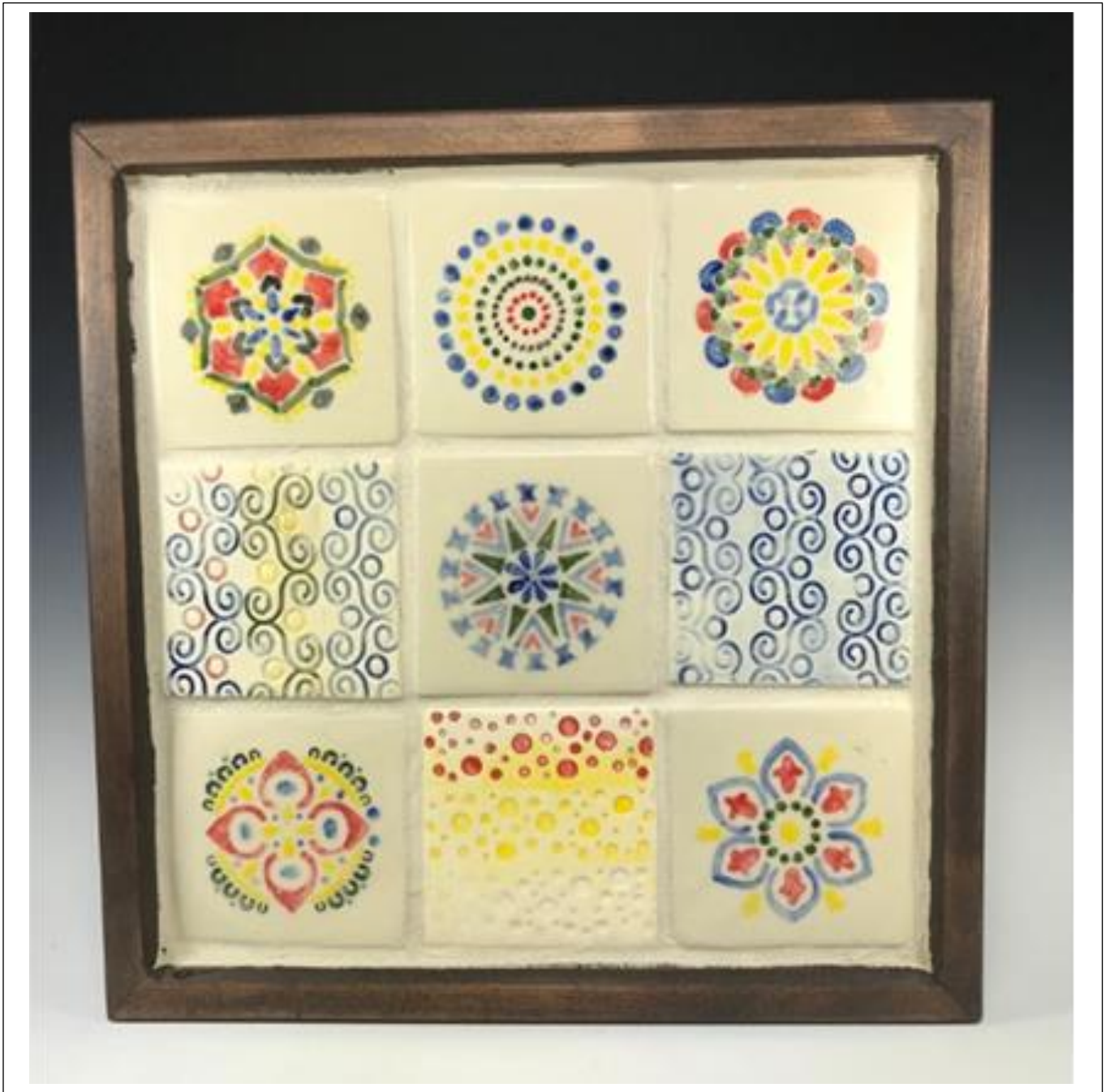
"Tiles" (1st Year Student - 2019)