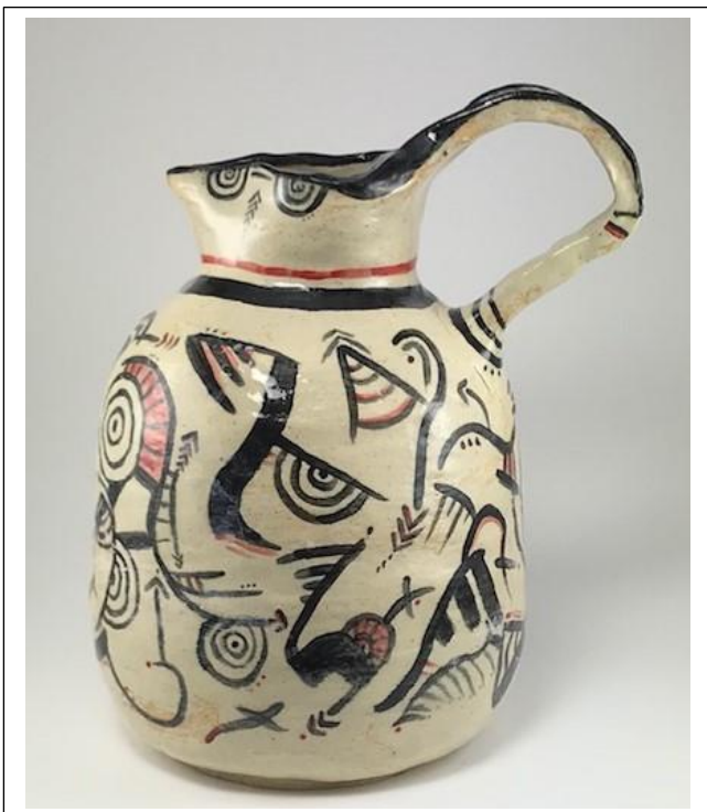
"Historical Pitcher" (1 st Semester Student - 2019)