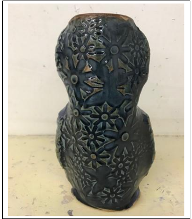
"Blue Vase" (2 nd Year Student - 2020)