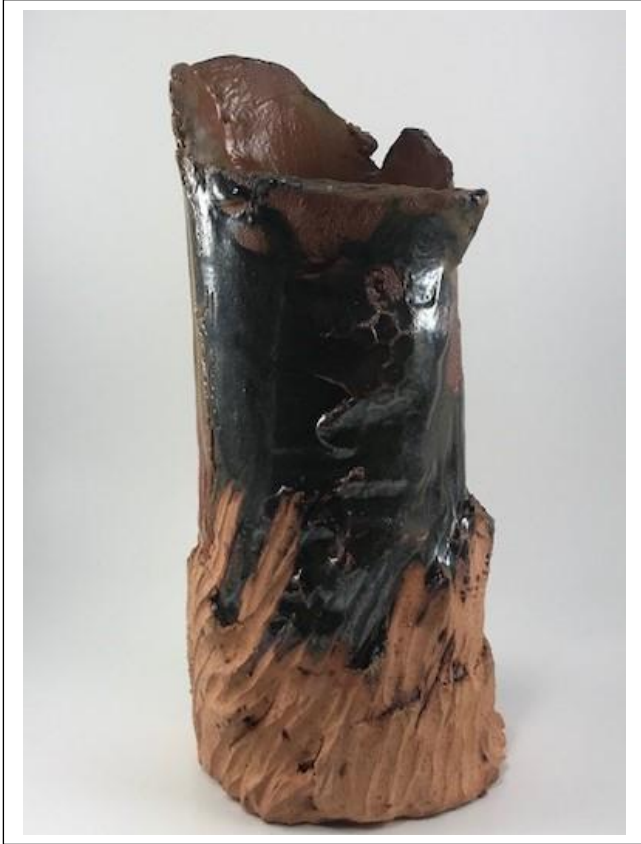
"Thrown & Sculpted" (1 st Year Student - 2019)