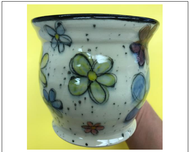
"Flower Mug" (3 rd Year Student - 2019)