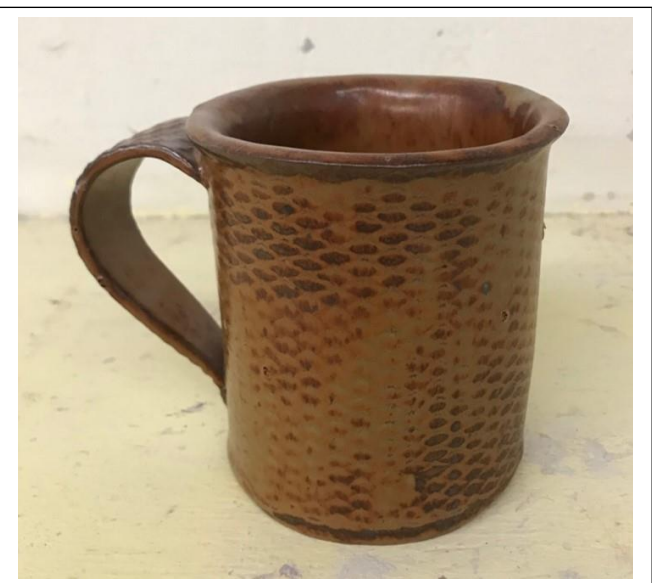
"Snakeskin Cup!" (4 th Year Student - 2019)