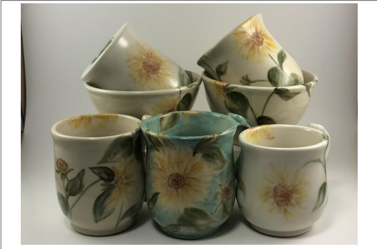
"Flower Set" (1 st Year Student - 2020)