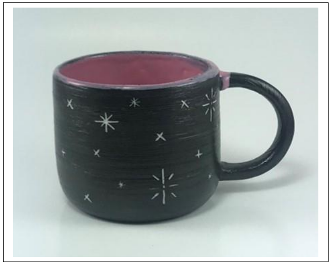
"Starlight Cup" (3 rd Year Student - 2019)