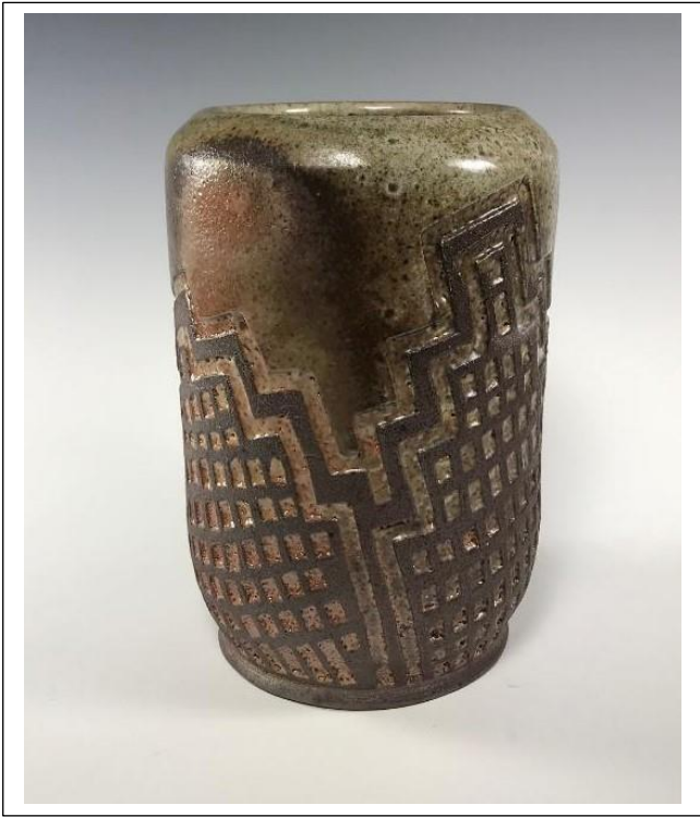
"City" (4 th Year Student - 2020)