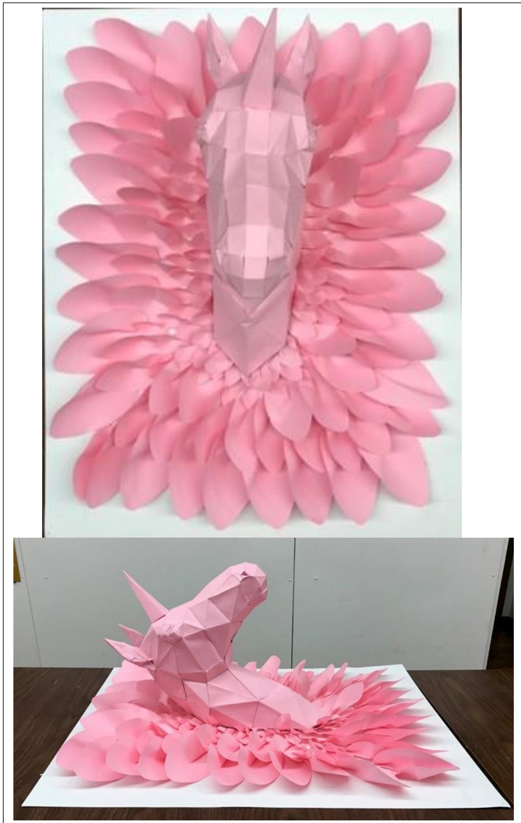
"Horse Petals" (1 st 3D Design Year Student - 2019)