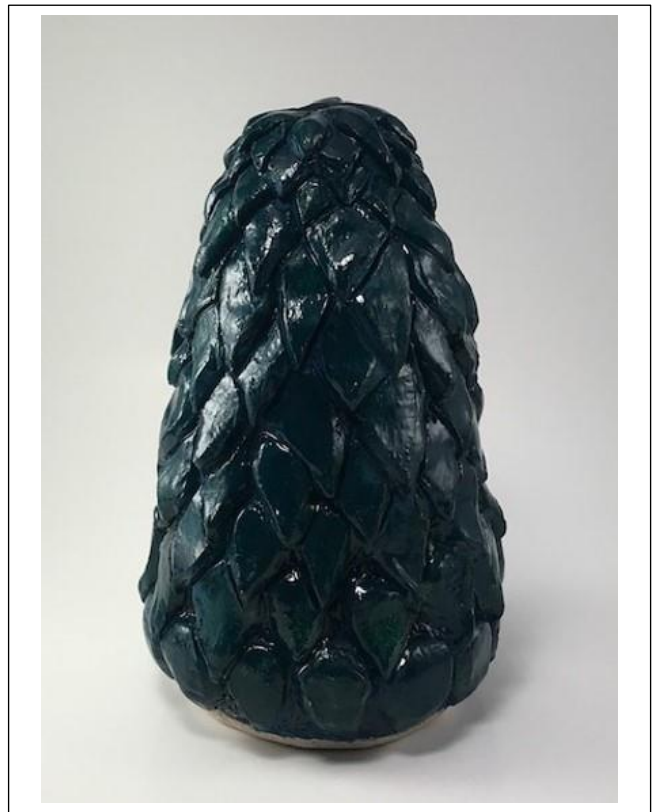
"Shrub" (1 st Year Sculpture Student - 2019)