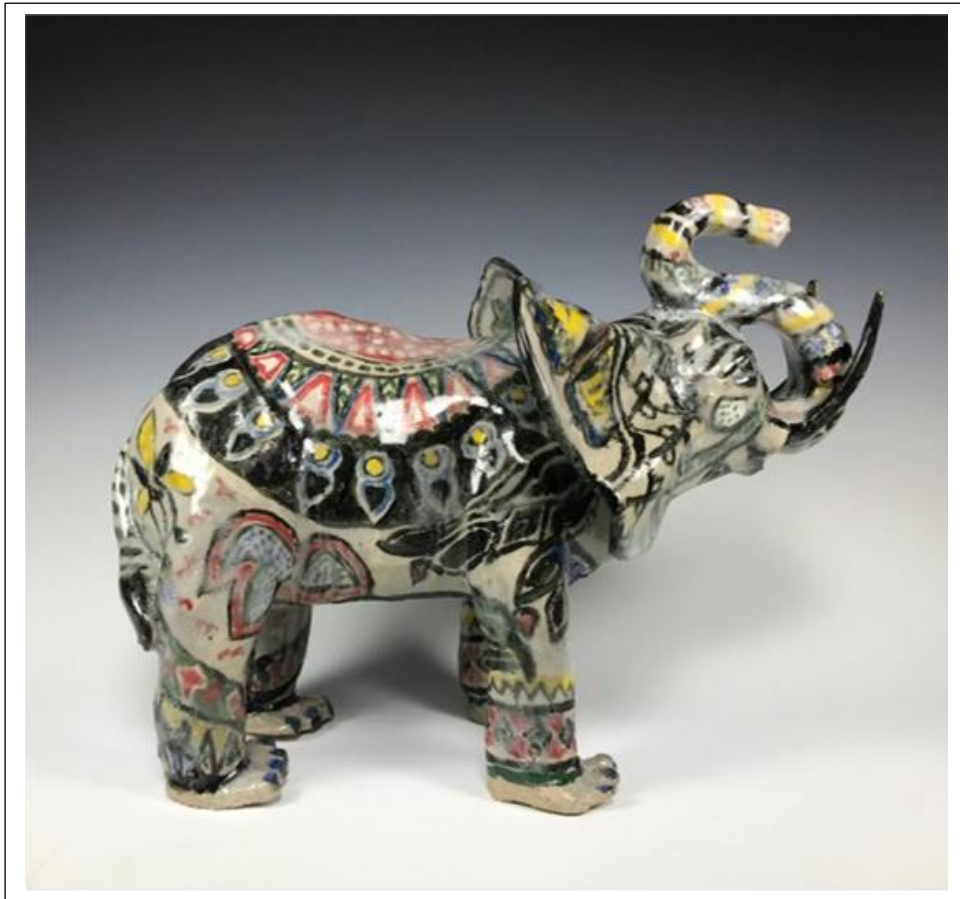
"Elephant" (2 nd Year Sculpture Student - 2020)