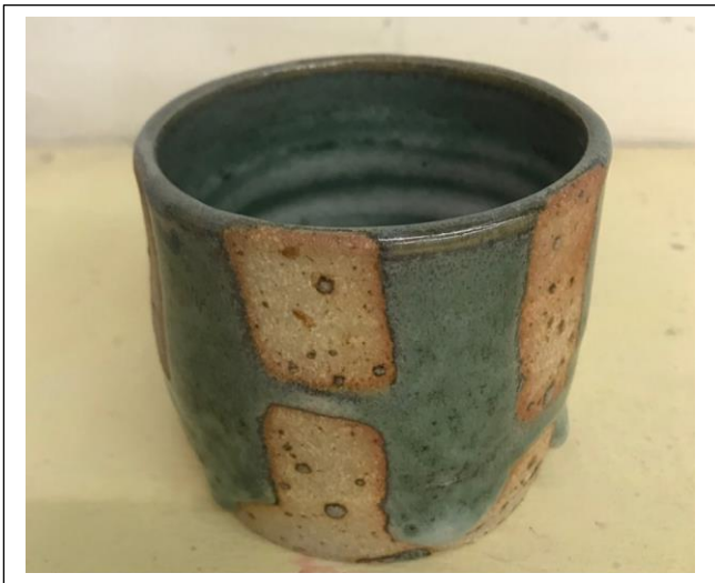
"Chawan" (3 rd Year Student - 2019)