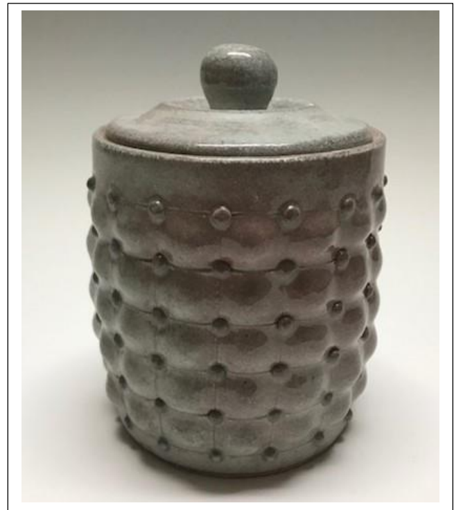
"Pillow Jar" (4 th Year Student - 2019)