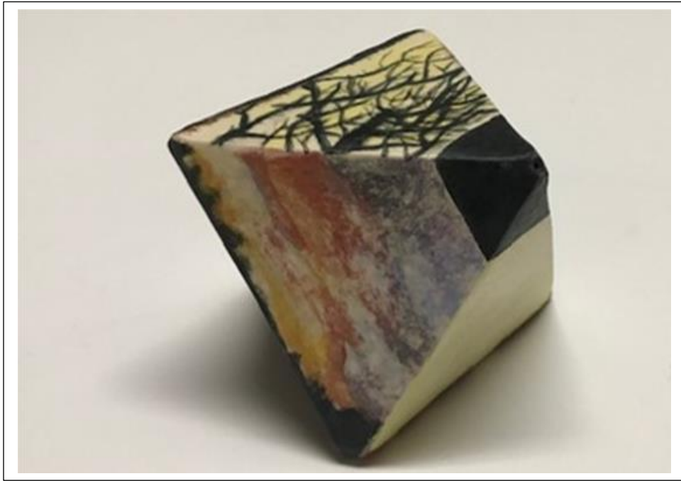
"Octahedron" (2 nd Year 3D Design Student - 2019)