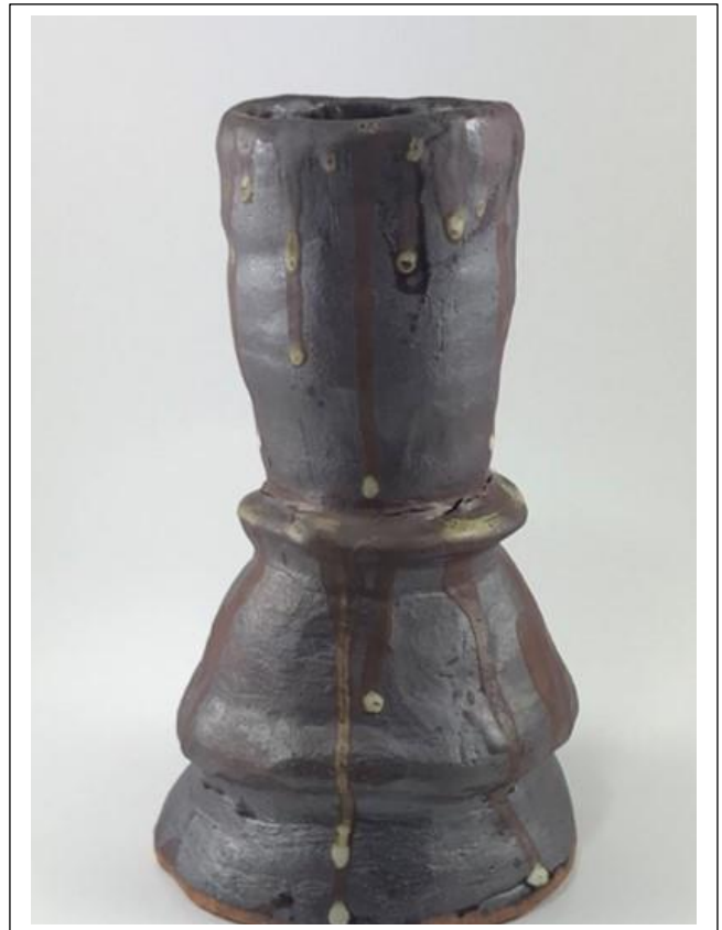
"Molten Vase" (1 st Year Student)